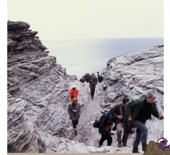
How many fish can you find?