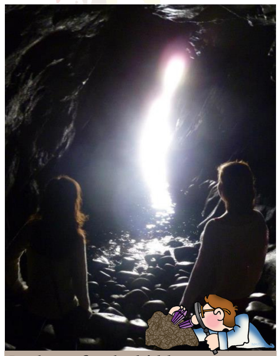
Look out for the hidden entrance to the 'smugglers' cave

Millions of years of storm driven erosion upon the weak fault plane have created this long narrow cave.