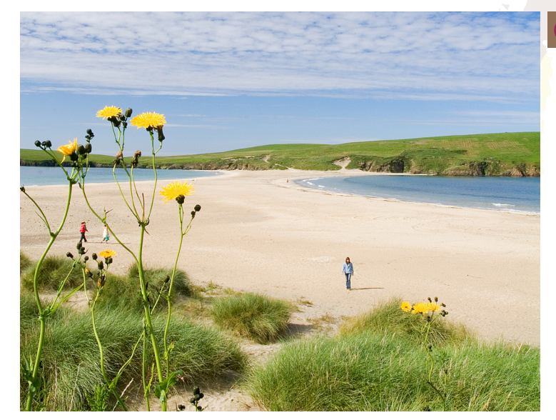
See the replica St Ninian's Isle treasure at the Shetland Museum and Archives