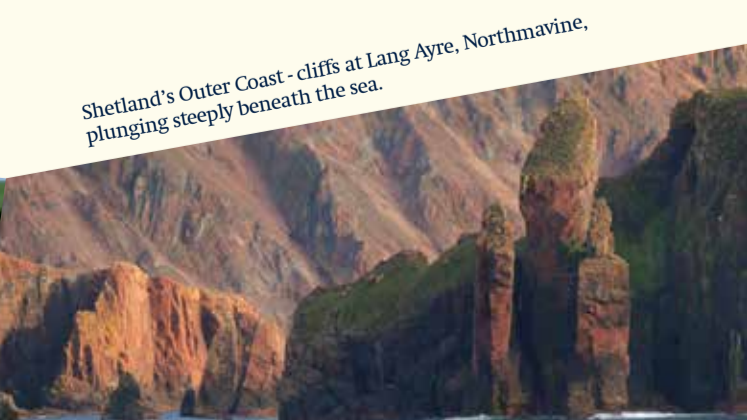
Shetland's Outer Coast - cliffs at Lang Ayre, Northmavine, plunging steeply beneath the sea.

This gentle coastline contrasts dramatically with the Outer Coast with its spectacular high cliffs plunging steeply beneath the sea.