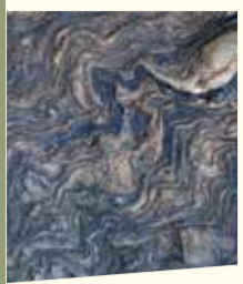
Folded rocks at Ollaberry

About 300 million years ago, Laurentia and Scandinavia tried to drift apart again. A first attempt east of Shetland failed, but led to the deposition of several kilometres of sediments forming the North Sea basin, which now contains the oil fields. 60 million years ago the rift opening the Atlantic Ocean occurred west of Shetland, leaving Shetland attached to Scotland as part of Scandinavia and Europe.