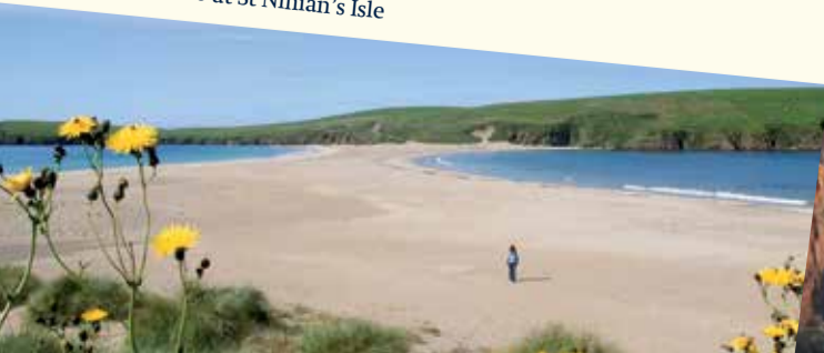
The tombolo at St Ninian's Isle

Only older valleys, carved by ancient rivers at a time when Shetland was part of a much larger land mass, run east and west across the grain of rocks. Perhaps the oldest of these cuts through the Clift Hills at Quarff. First formed 400 million years ago, it was filled in with desert sands, and then re-excavated more recently by ice.