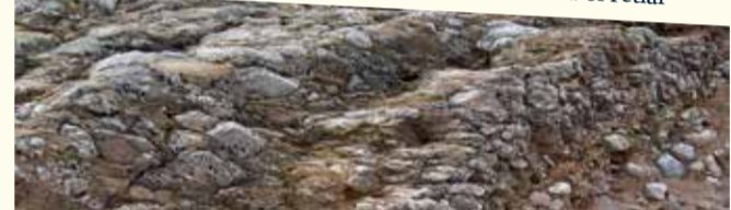
The unique Funzie conglomerate, found on the island of Fetlar

5 The deformed conglomerate rocks at Funzie, in Fetlar were distorted by massive earth movements involving the emplacement of the ophiolite, which stretched the pebbles into 'cigar' shapes.