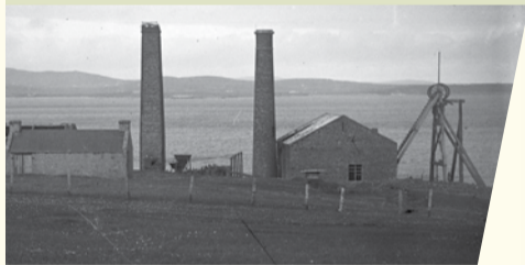
Sand Lodge mine, Sandwick, which operated sporadically between 1790 and 1929

11 Hot water trapped in the Earth's crust dissolved minerals from the rock. Escaping through fractures, the water cooled again and the minerals crystallised out to form hydrothermal veins that criss-cross Shetland's rocks. Many contain interesting minerals and metal ores, but only one, at Sand Lodge, proved rich enough to be mined commercially for iron and copper ores.