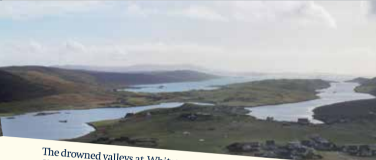
The drowned valleys at Whiteness and Stromness are typical of Shetland's Inner Coast