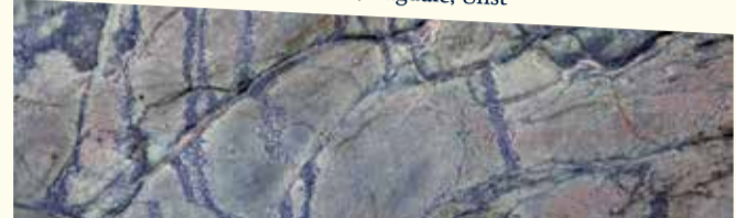
Chromite bands in serpentinite, Hagdale, Unst

4 As America drifted towards Scandinavia, most of the floor of the Iapetus Ocean sank into the Earth's interior, but a fragment was trapped between the colliding continents (an ophiolite). The unusual serpentinite rocks of Unst and Fetlar are a relic of this vanished ocean floor, giving rise to a strange landscape of peat free rusty-brown crags, flower-rich heathland and bare gravel that supports rare plants. They also contain rare minerals such as chromite - a chromium ore, which was mined in Unst for over a century.