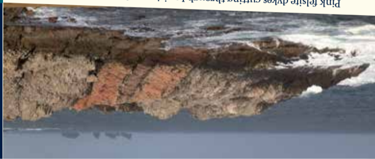
Pink felsite dykes cutting through Lewisian rocks at Wlgi Geos, North Roe

Our continents are not static but drift slowly over the Earth's surface, occasionally splitting apart or colliding as new oceans form or old ones shrink or vanish. 600 million years ago, Shetland was joined to Laurentia (proto America) and separated from Norway by an ocean called Iapetus. Shetland's rocks tell the story of how this ocean disappeared when Shetland and Laurentia collided with Norway and Europe.