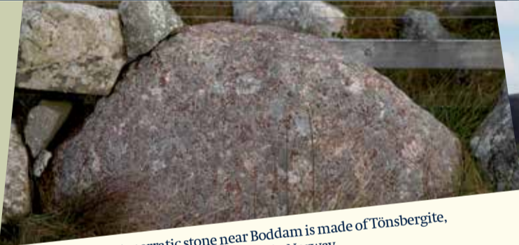
The Dalsetter erratic stone near Boddam is made of Tönsbergite, a type of rock only found near Oslo in Norway