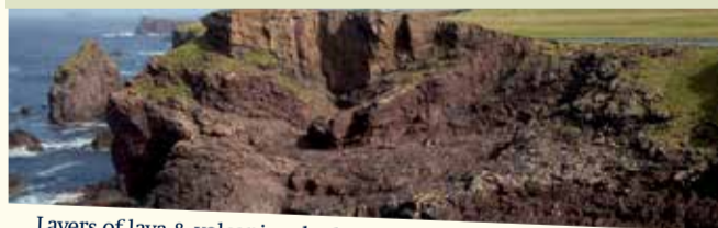
Layers of lava & volcanic ash along the Eshaness coastline

10 Where magma found its way to the Earth's surface, it erupted to form volcanoes. At Eshaness, the sea has carved away the flank of an ancient volcano exposing layer upon layer of lava and volcanic ash in the cliffs. Papa Stour too is formed of volcanic rock, but it is mainly pink rhyolite lava, rather than the dark purple andesite of Eshaness.