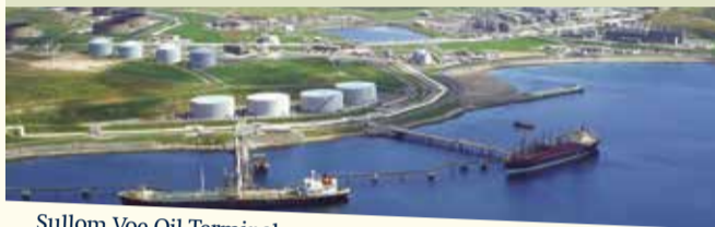
Sullom Voe Oil Terminal

12 The rift that initially opened along the North Sea 300 million years ago is of major importance for Shetland. Marine sediment that slowly filled the rift contained remains of billions of tiny creatures that would eventually give rise to North Sea oil. Today, this oil travels by pipe under the sea to Sullom Voe - Europe's largest oil terminal - where it is loaded onto ships for export. This terminal began operating in 1978, and remains a large source of employment for Shetland.