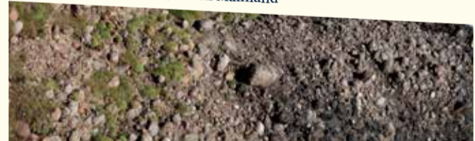
Beds of conglomerate, South Mainland

6 A desert basin surrounded by high mountains lay at the heart of the new super-continent. To the north of Lerwick, beds of conglomerate - a rock made up of water-worn pebbles - show where mountain streams spilled onto the desert plain. Further south between Brindister and Quarff, similar rocks made of angular fragments, known as breccia , were once banks of scree that cloaked the mountainsides.