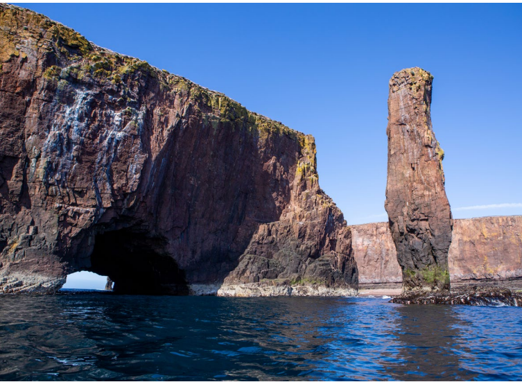
↑ Lyra Skerry off Papa Stour Calum Toogood