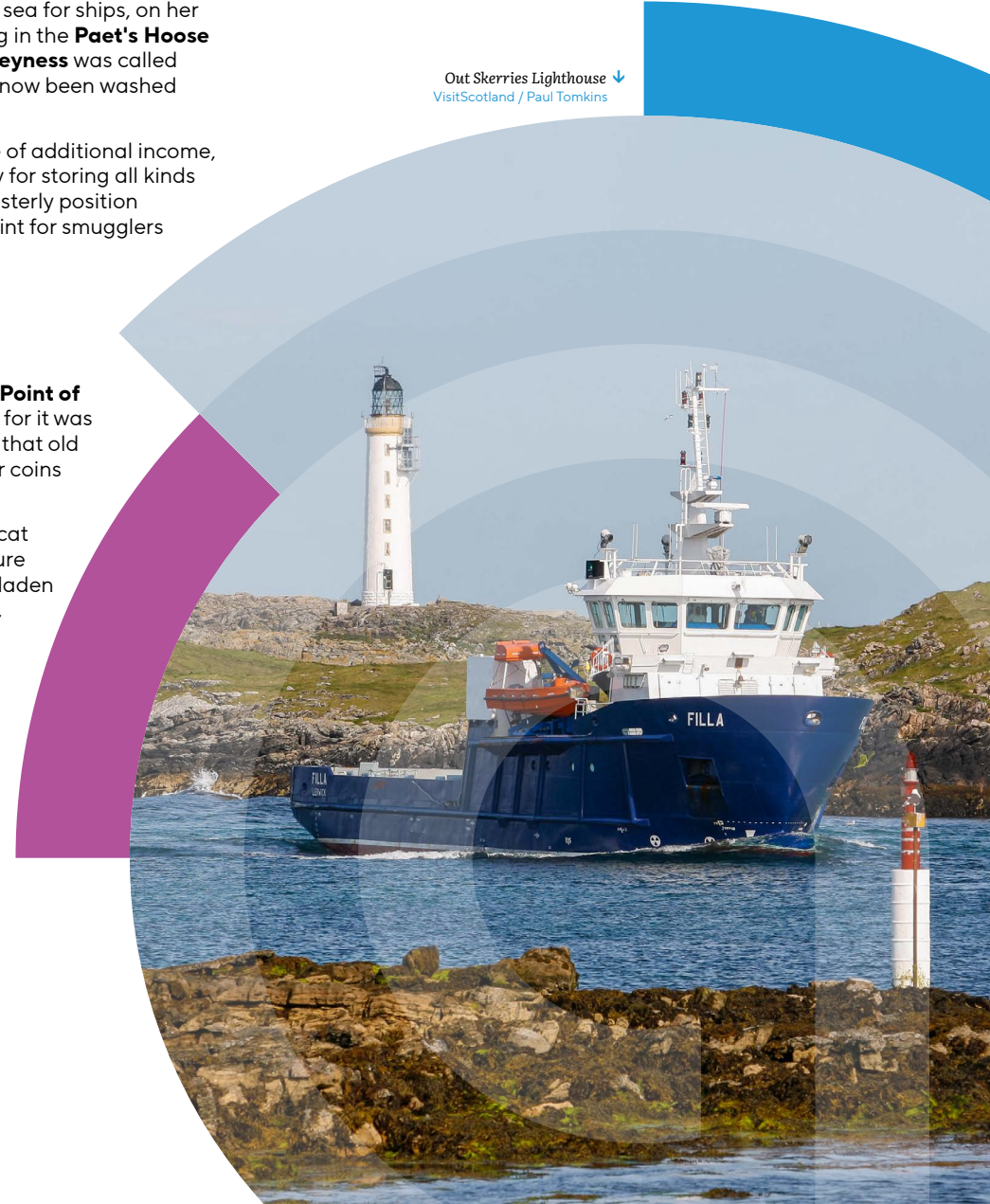
Out Skerries Lighthouse

Skerries remains a popular destination for underwater explorers, as well as more casual beachcombers hoping for the glitter of gold in the sand.