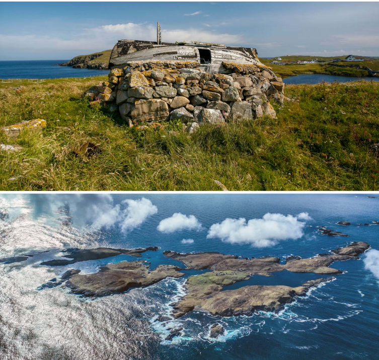
↑ Housay