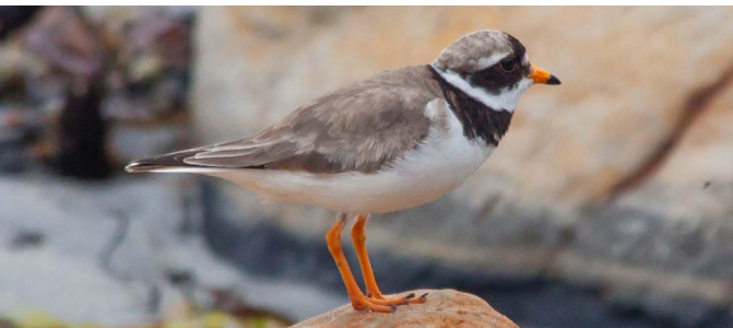
↑ Ringed Plover Colin Nutt